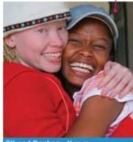
CK and Daphne - Kenya