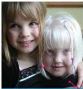
Sisters - United Kingdom