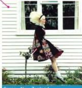
Ceara - New Zealand