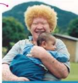
Mere - Fiji