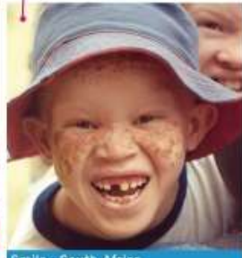
Smile - South Africa