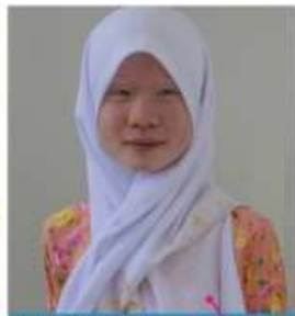
Maizan - Malaysia