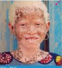
Siri - Mali