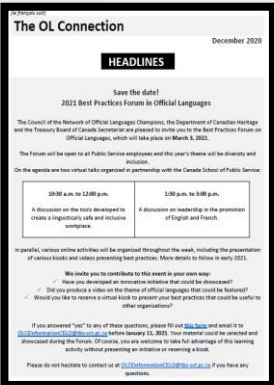
THE OL CONNECTION

CLICK BELOW TO JOIN US FOR A CHAT ON MS TEAMS! March 1 / 10:30AM – 11:30AM EST March 1 / 2:00PM – 3:00PM EST