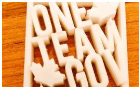
OneTeamGov Canada Toronto meetup #3