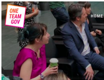
OneTeamGov Canada Ottawa breakfast | Déjeuner GouvEnsemble Canada à Ottawa

1 Elgin St | 8:30 AM-9:30 AM Wednesday 11 December 2019