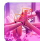
OneTeamGov Victoria, BC Public group