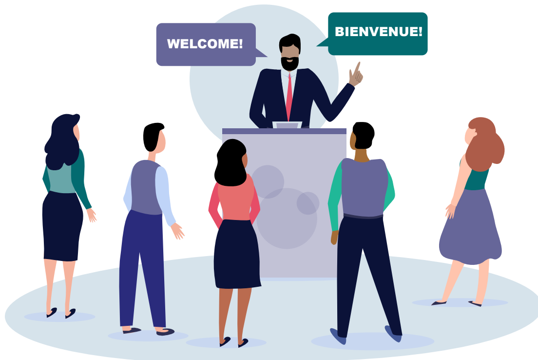
Managers and executives must walk the talk and lead by example