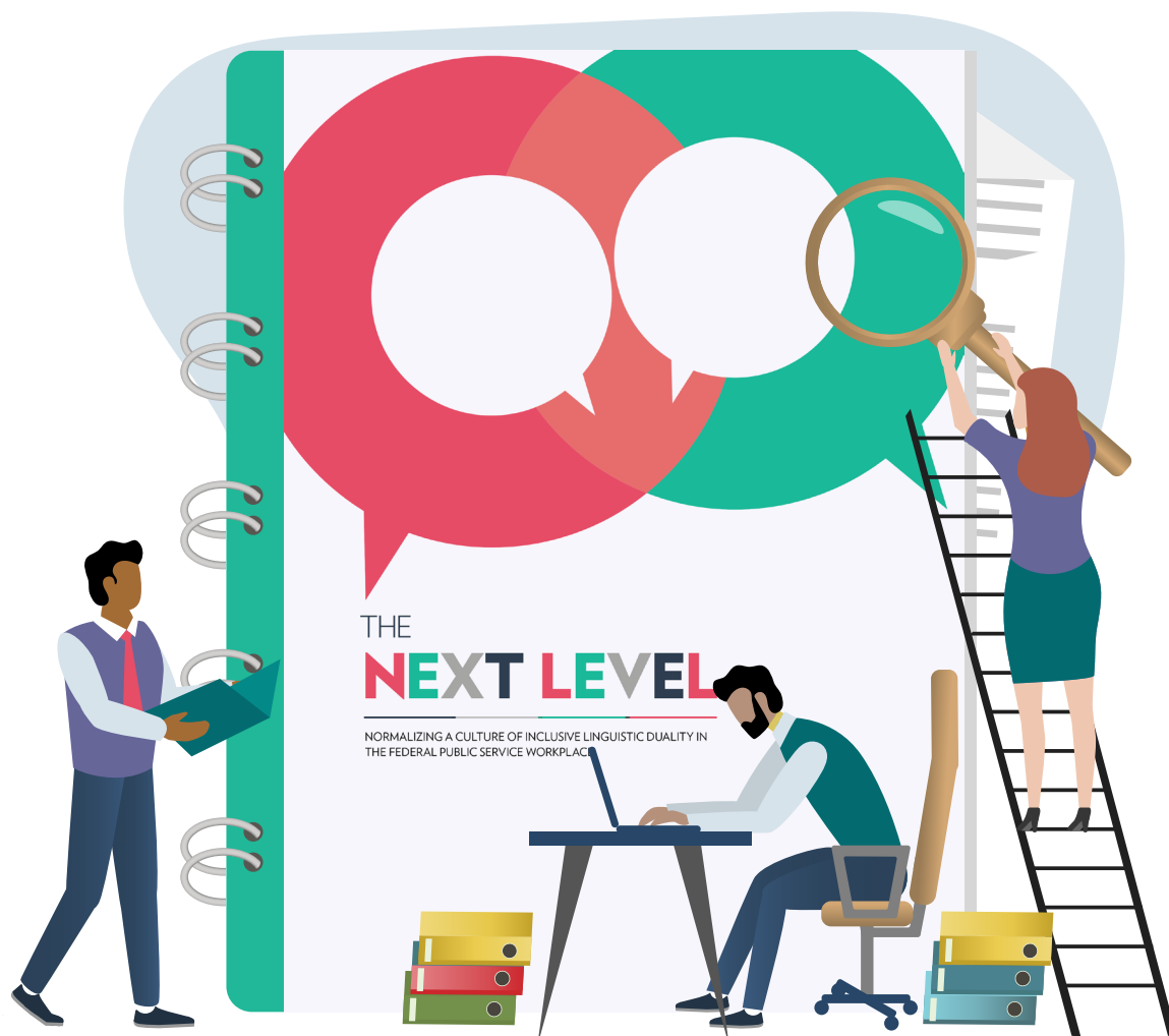
The Next Level: Normalizing a culture of inclusive linguistic duality in the Federal Public Service workplace

This video showcases testimonials from executives, managers and employees across the Federal Public Service and the country who share their thoughts on how leaders play an important role in setting the tone. It gives valuable insight on how you can create an environment where employees feel comfortable using the official language of their choice.